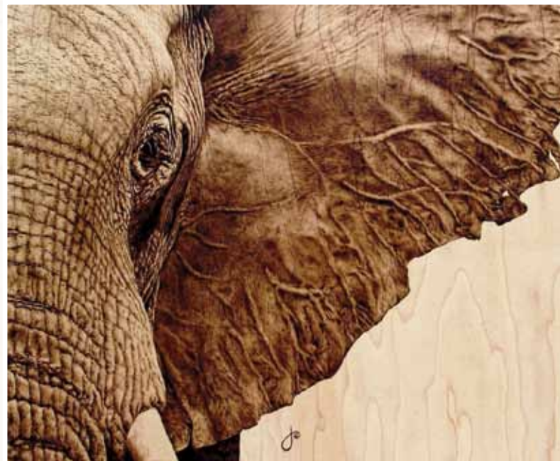
In Out of Nowhere , a 15" by 22" burning on maple, Julie details an African elephant's ears and muscular trunk using just heat to create the shapes, values, and textures.