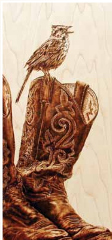
According to Julie, the song sparrow is in an unlikely environment, but seems comfortable enough to belt out a tune. She borrowed the title, Nothing but Cowboy Boots , from a country-western song. 20" by 12" pyrography on maple.